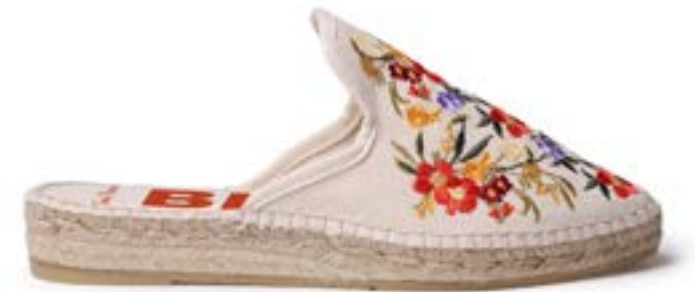
CULIP DALIA $175