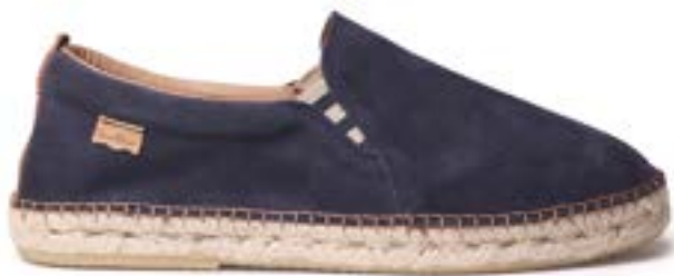
MARTI NIT $160