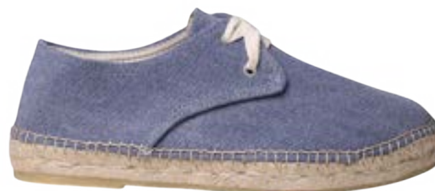
ABRIL DENIM $131