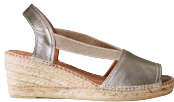
TEIDE-P PLATINUM $142