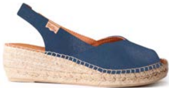
BERNIA-P OCEAN $160