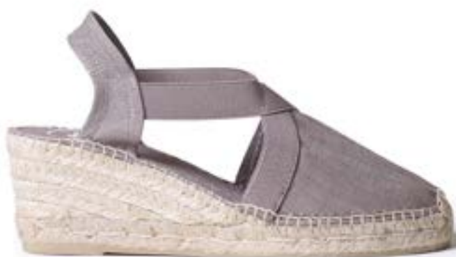
TER TAUPE $121