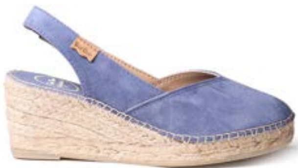
BETTY-A INDIGO $160