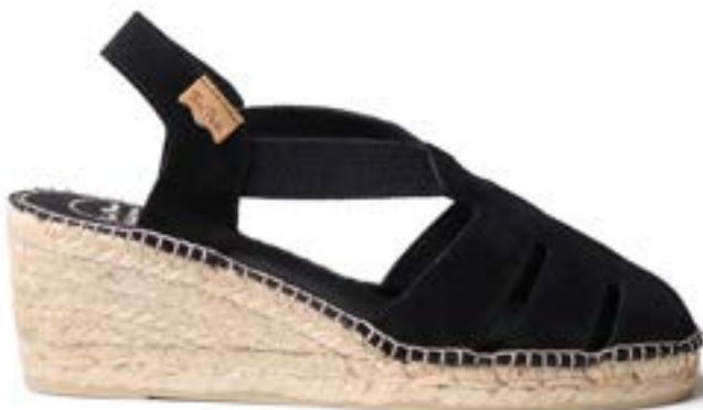
TRAPA BLACK $153