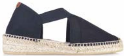
ELASTIC BLACK $87