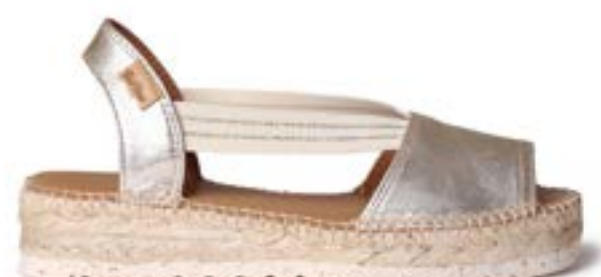
ESTEL-SW PLATINUM $160