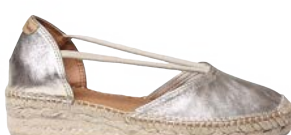
ERLA-P PLATINUM $142