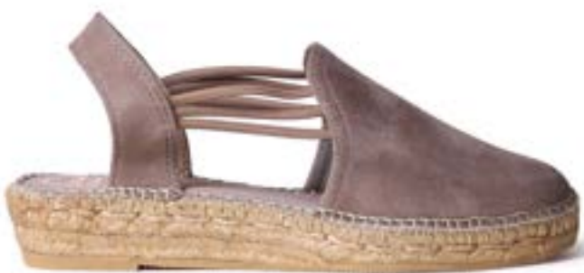
NURIA TAUPE $138