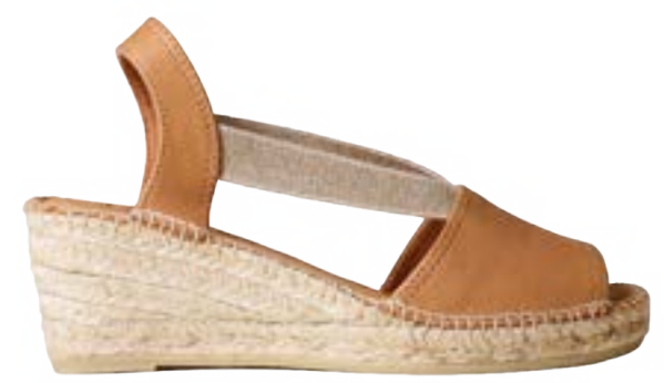
TEIDE-P TAN $142