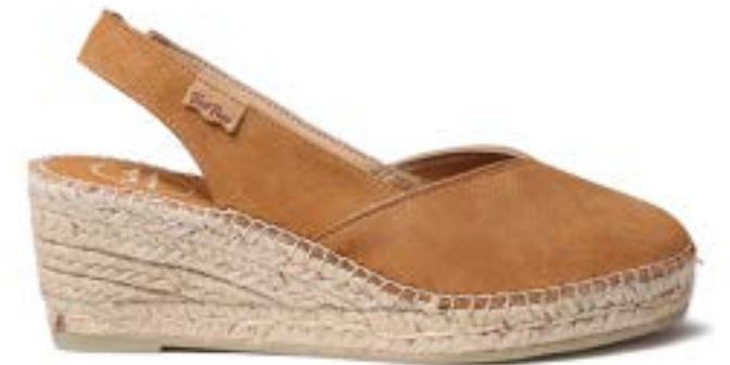
BETTY-A TAN $160