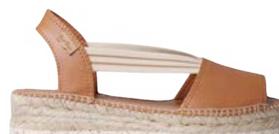
ESTEL-SW TAN $160