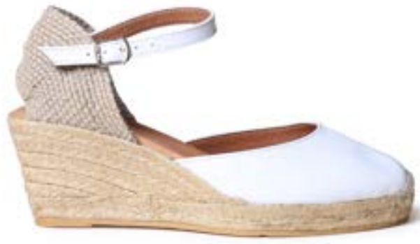
COSTA-5 WHITE $160