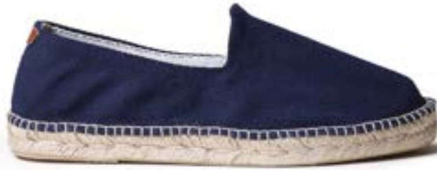
MONTGRI NAVY $98