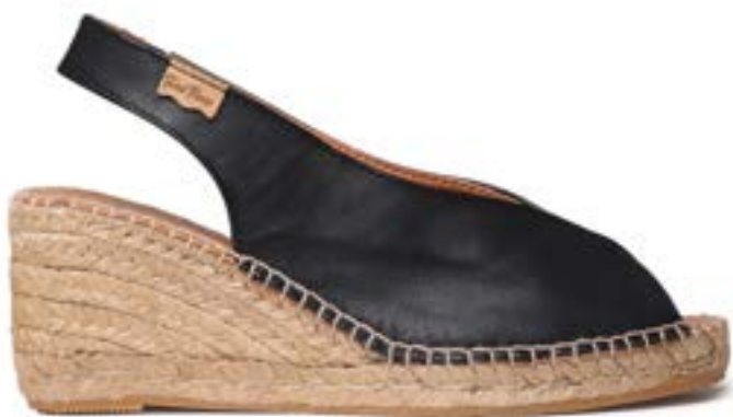
LAILA-P BLACK $164