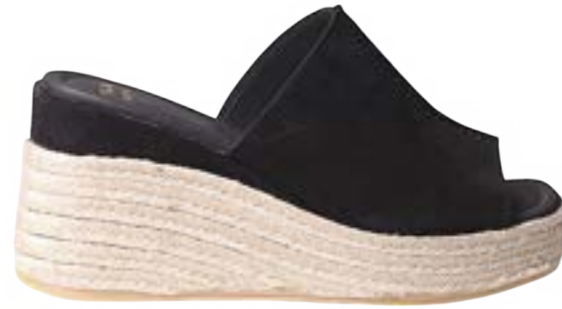
MIRIAM BLACK $215