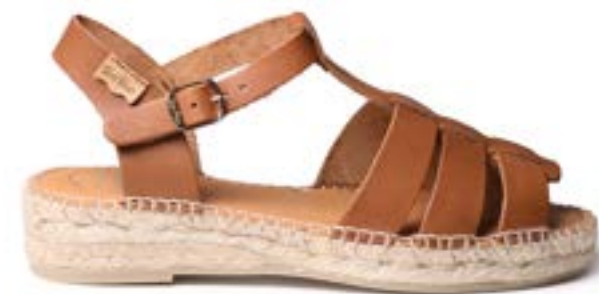
EMMA NOUGAT $149