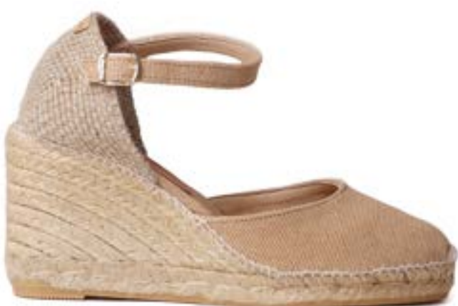
PIPER-GY TOBACCO $160