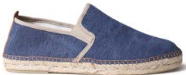
DALLAS NAVY $175