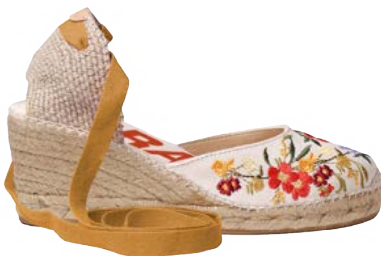
CASTELL DALIA $175