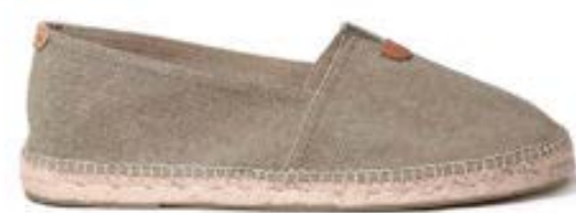
BLANES-ER KHAKI $98