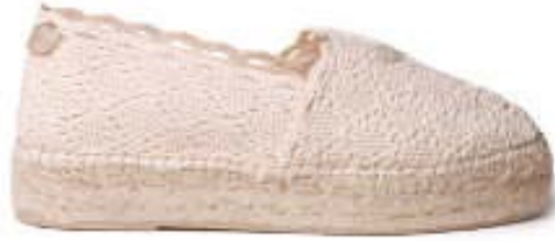
AITANA ECRU $160