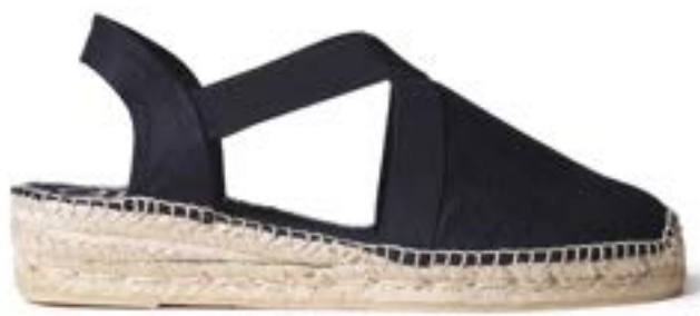
VERONA BLACK $121