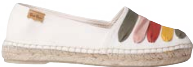
ROSE-CM TROPIC $121