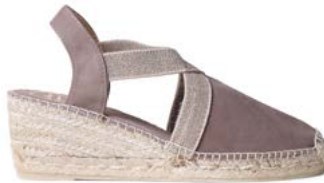
TONA TAUPE $149