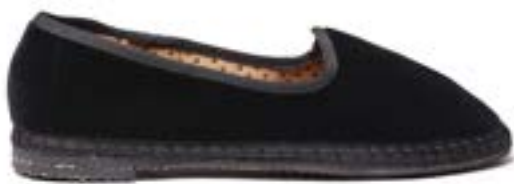
CINTIA BLACK $160