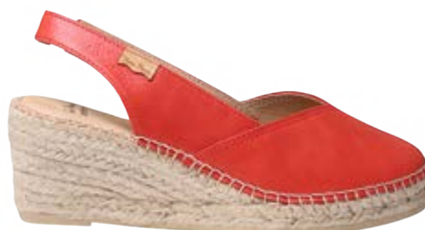
TERMAL ROIG $171