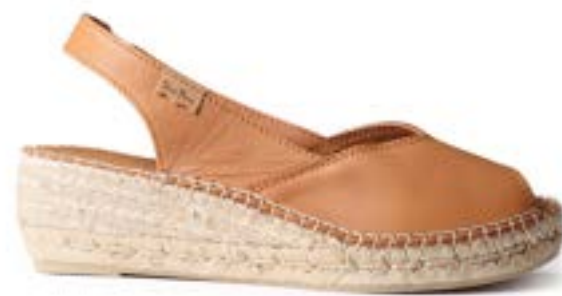
BERNIA-P TAN $160