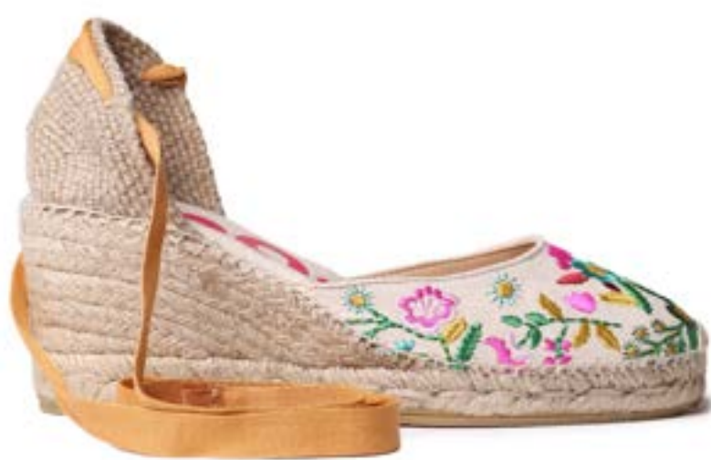
CASTELL FLORAL $175