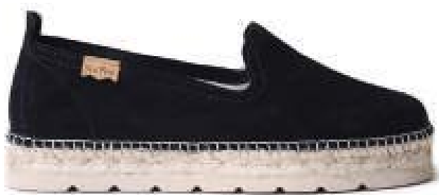
AUREM BLACK $149