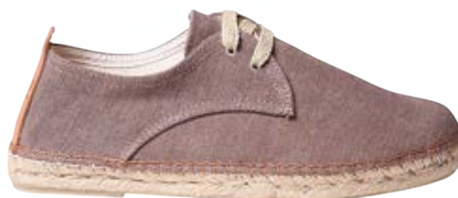
DIXON BROWN $138