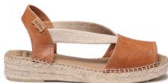
TALA TAN $152.9