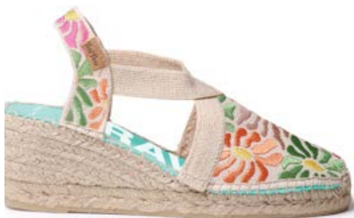
MONTJOI MOSAIC $182