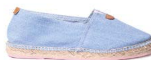
BLANES-GS SKY $98