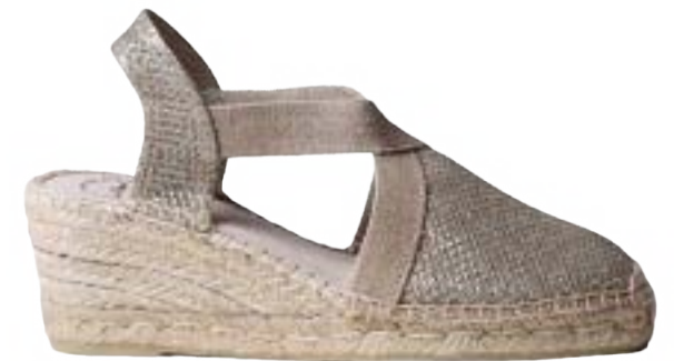
TRITON PLATINUM $131