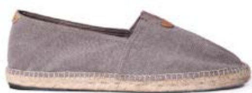
BLANES-ER GREY $98