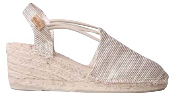
TANIA-ZR BEIGE $138