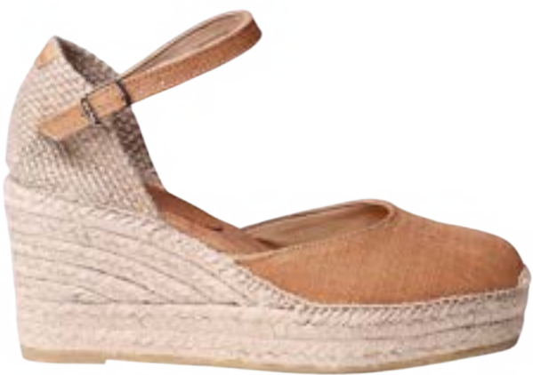
LAIA-NT TAN $175