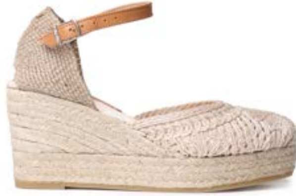
LOVINA NATURAL $208