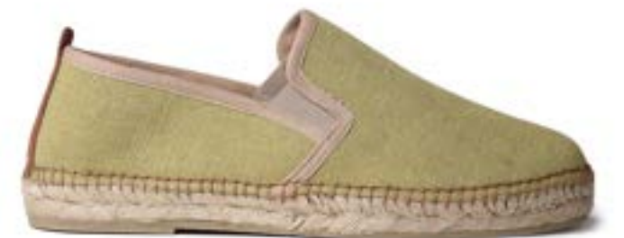
DALLAS KHAKE $175