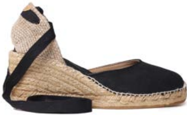
CALONGE BLACK $142