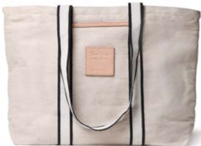
LOIRA ECRU $98