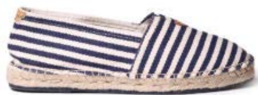
BLANES-DD NAVY $98