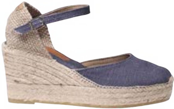
LAIA-NT NAVY $175