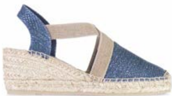
TRITON NAVY $131