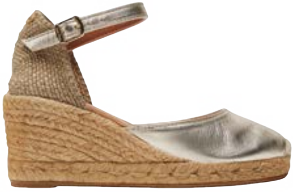
COSTA-5 PLATINUM $160