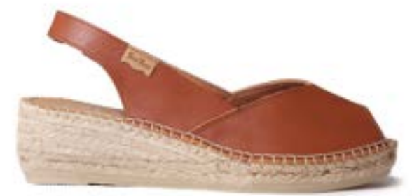
BERNIA-P NOUGAT $160