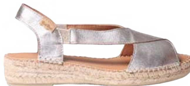
ELDA-P PLATINUM $160