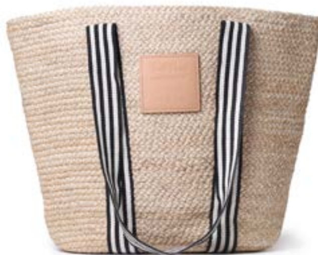
OPORTO NATURAL $120