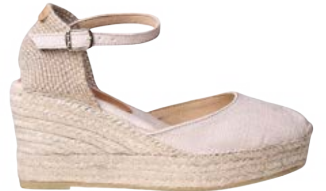
LAIA-NT STONE $175