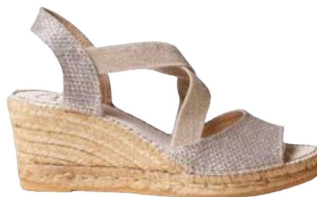
SOL-S PLATINUM $142