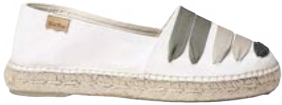
ROSE-CM KHAKE $121