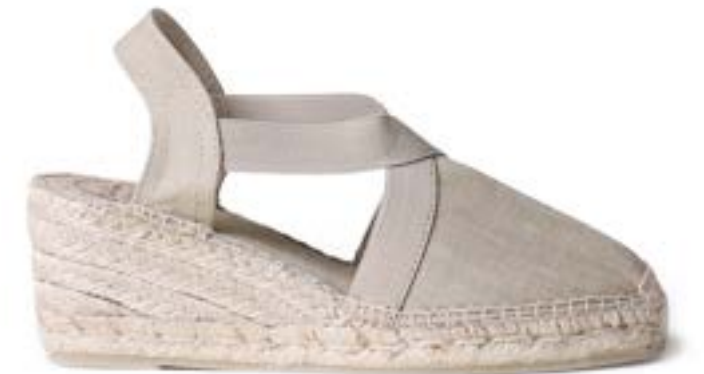
TER STONE $121