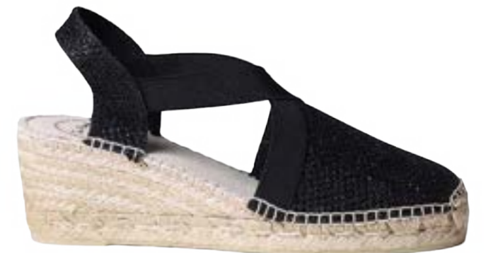
TRITON BLACK $131