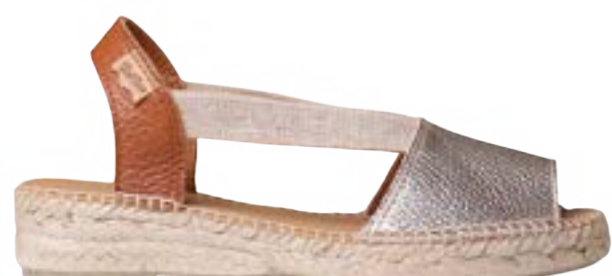
ESTEL-BG PLATINUM-TAN $138