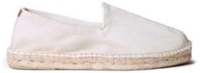
MONTGRI ECRU $87