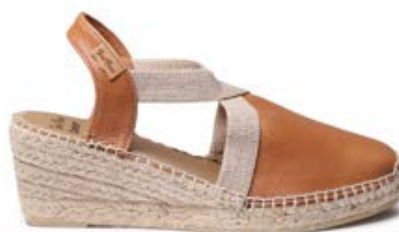
TUNDRA TAN $160