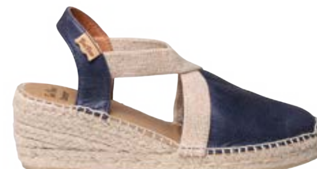
TUNDRA NAVY $160