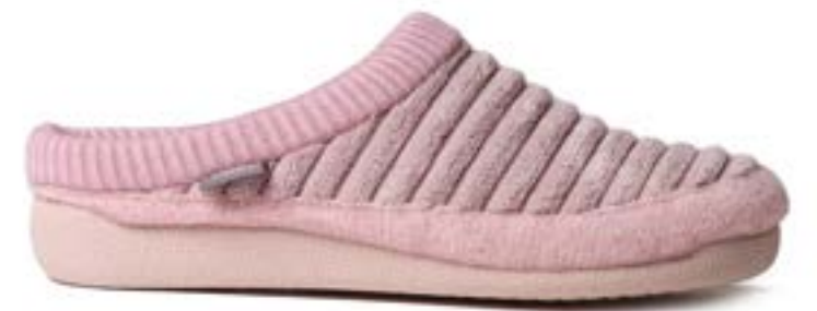
MALU-OD NUDE $98