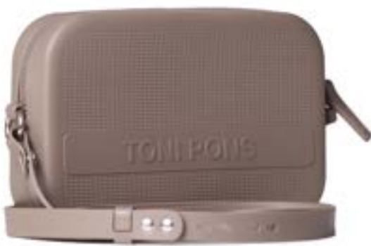
GINGER BRIOWN $98