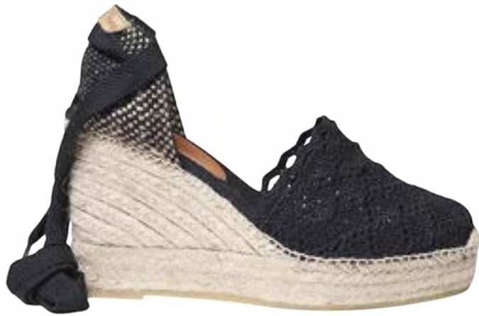
MARTINA BLACK $175