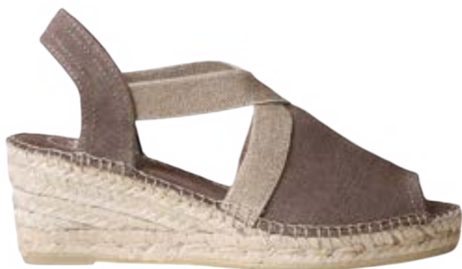
BREDA-V BROWN $131