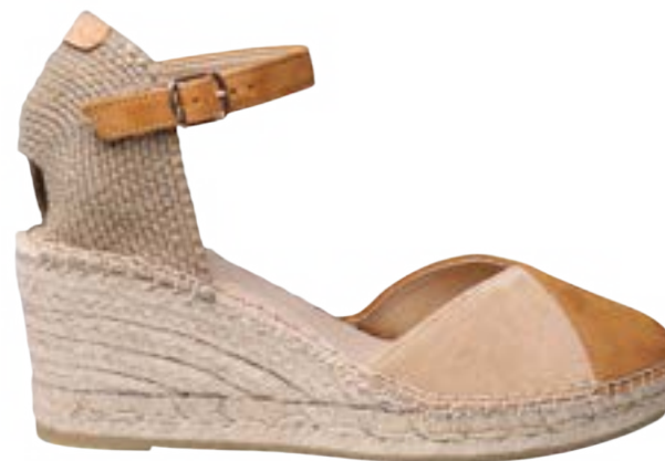
BERAL TAN-BEIGE $160