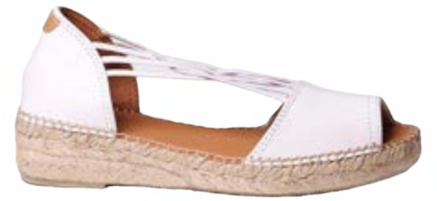
EBRE-P WHITE $153