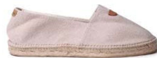
BLANES-ER ECRU $98