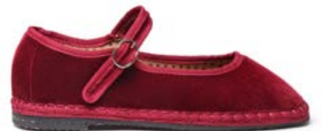
CLOE BURGUNDY $160