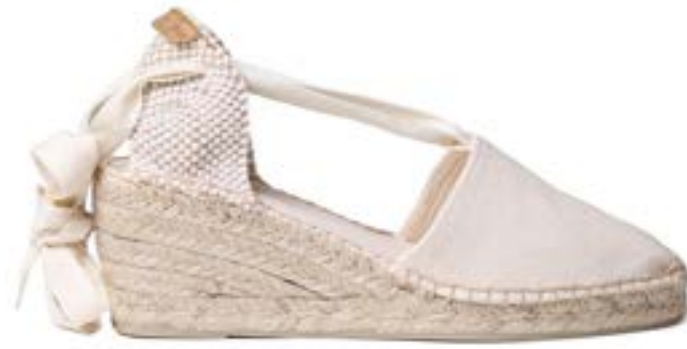
VALENCIA ECRU $127