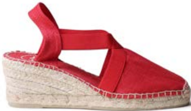
TER RED $121