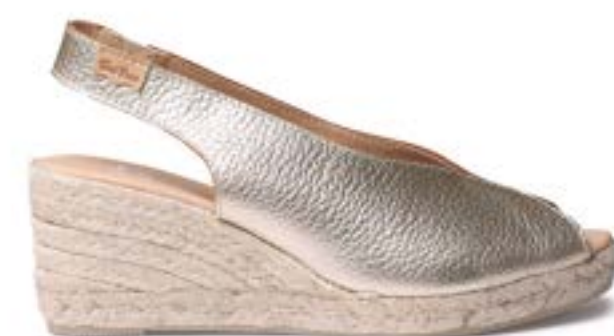
BOIRA PLATINUM $175