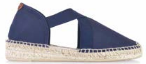
ELASTIC NAVY $87