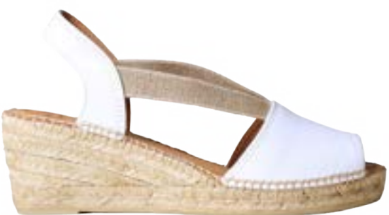
TEIDE-P WHITE $142