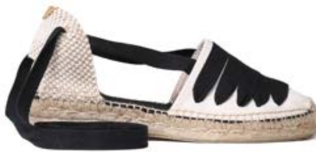
GAVET-CU BLACK $131