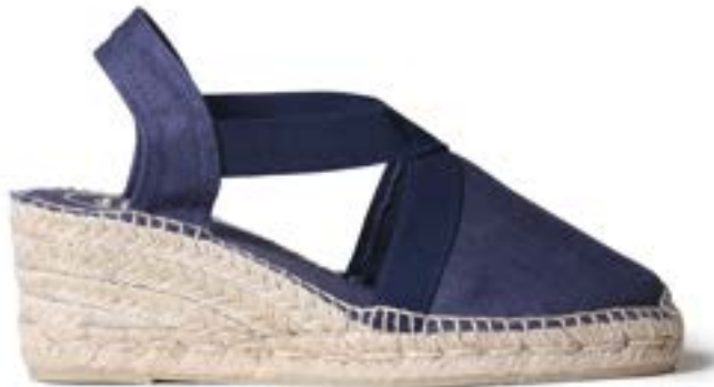
TER NAVY $121