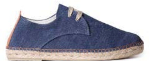
DIXON NAVY $138