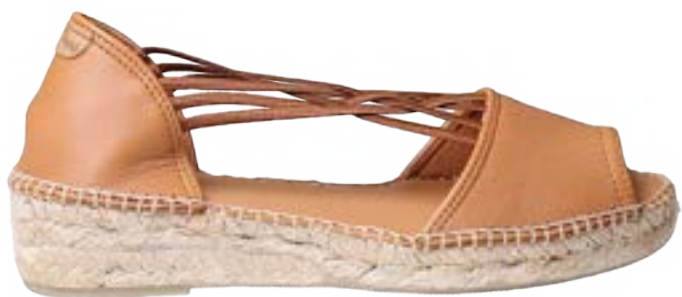
EBRE-P TAN $153