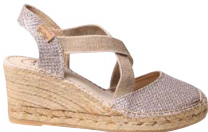
SABA-S PLATINUM $153