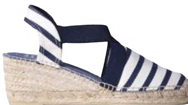
TARBES ECRU-NAVY $127