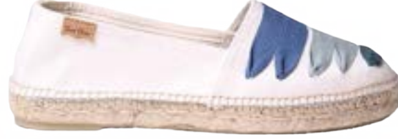
ROSE-CM BLUE $121