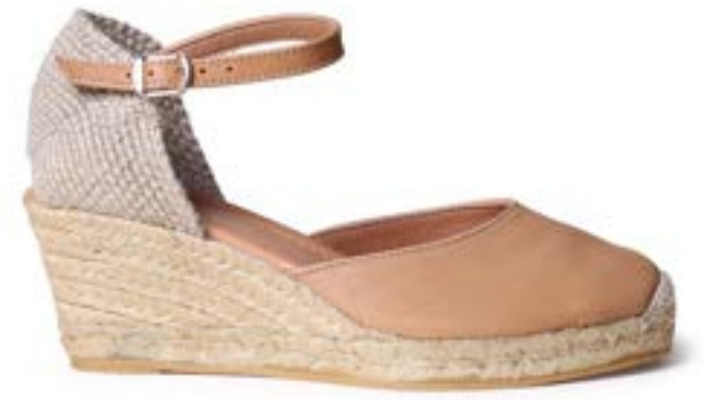
COSTA-5 TAN $160