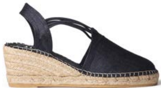
TURIA BLACK $131