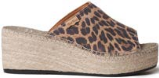
IVORI LEO $153