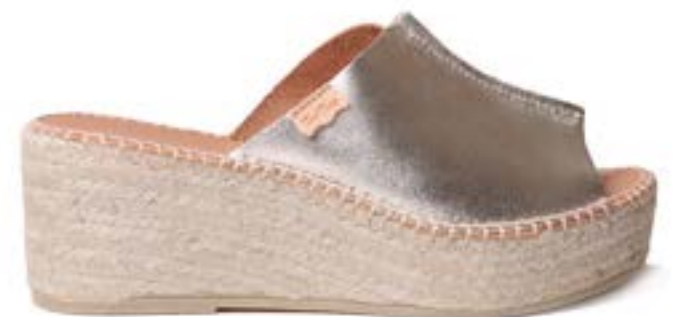
IVONNE PLATINUM $153