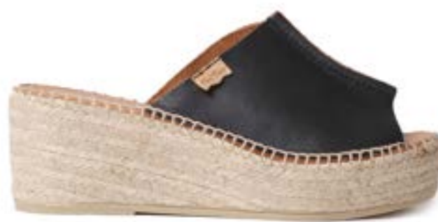
IVONNE BLACK $153