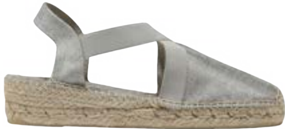
VIC SILVER $127