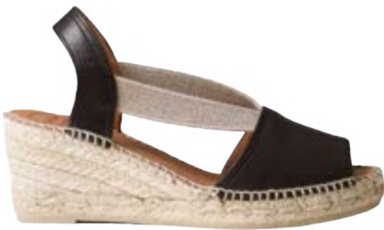
TEIDE-P BLACK $142