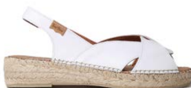
ENOLA-P WHITE $160