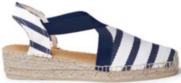
VINAROS ECRU-NAVY $120