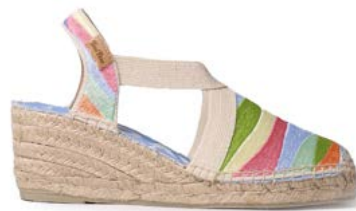
MONTJOI WAVES $182