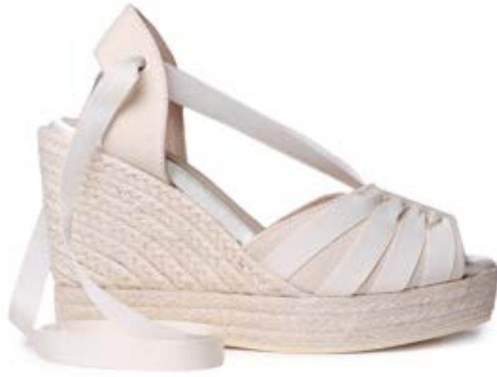
DELILAH ECRU $208