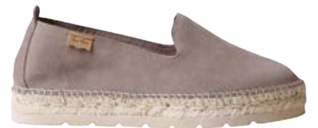
AUREM TAUPE $149