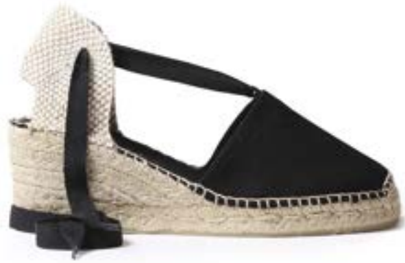
VALENCIA BLACK $127