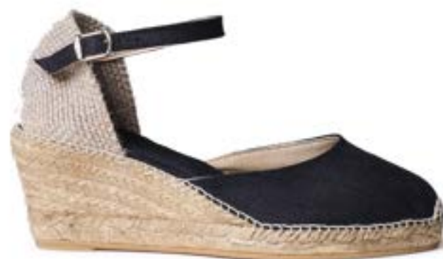
CALDES BLACK $149