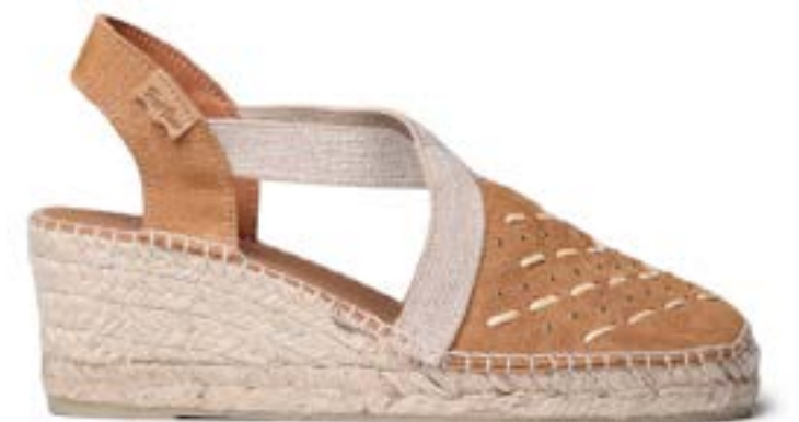
TATIANA TAN $175