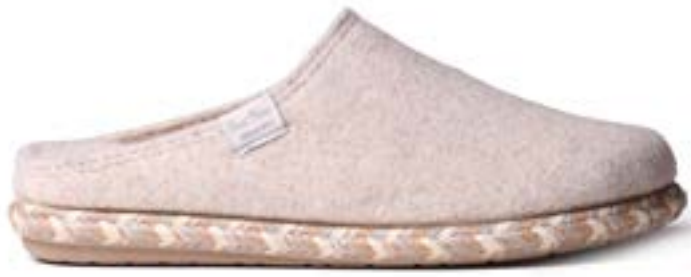
DELI-FP ECRU $94