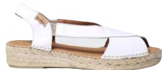
ELDA-P WHITE $160