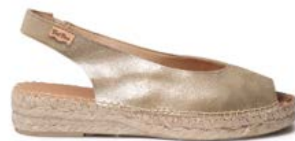
ERICA-AS BRONZE $160