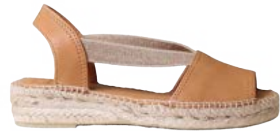
ETNA TAN $138