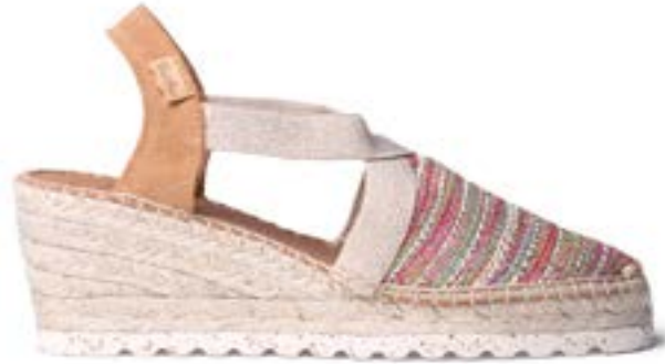
TERRA-CL MULTI $182