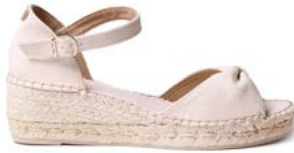
BILMA-L ECRU $149