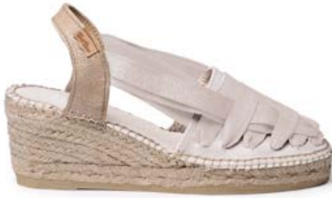
TRACY-CZ ECRU $160