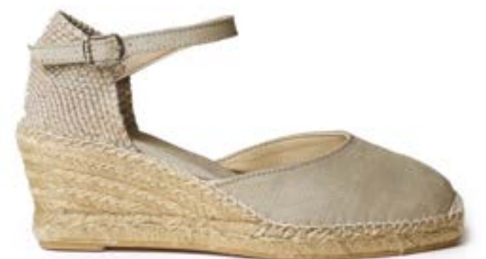
CALDES STONE $149