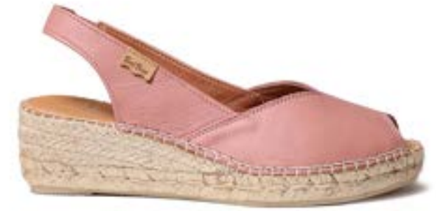
BERNIA-P PALE $160