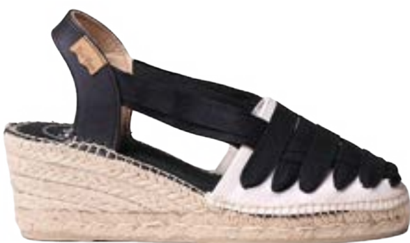
TRACY-CU BLACK $149