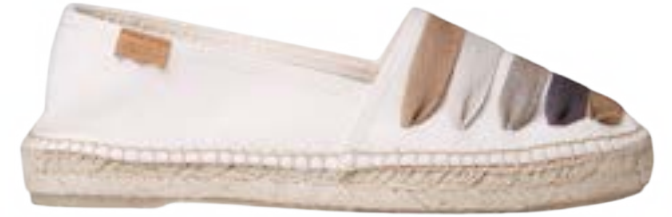
ROSE-CM TERRA $121