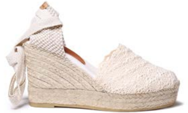
MARTINA ECRU $175