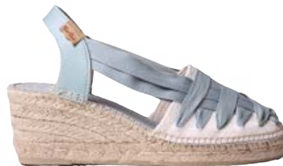
TRACY-CU SKY $149