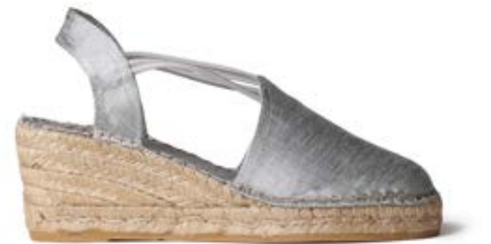
TURIA SILVER $131