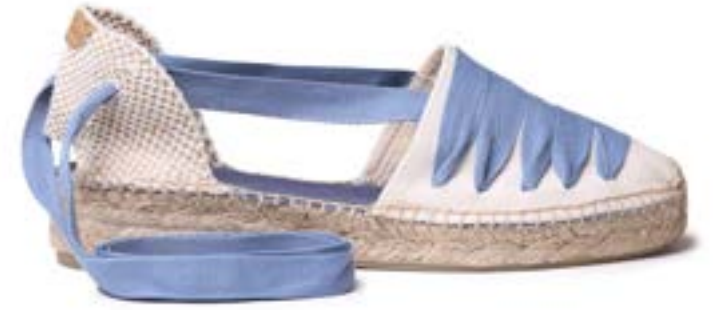
GAVET-CU DENIM $131