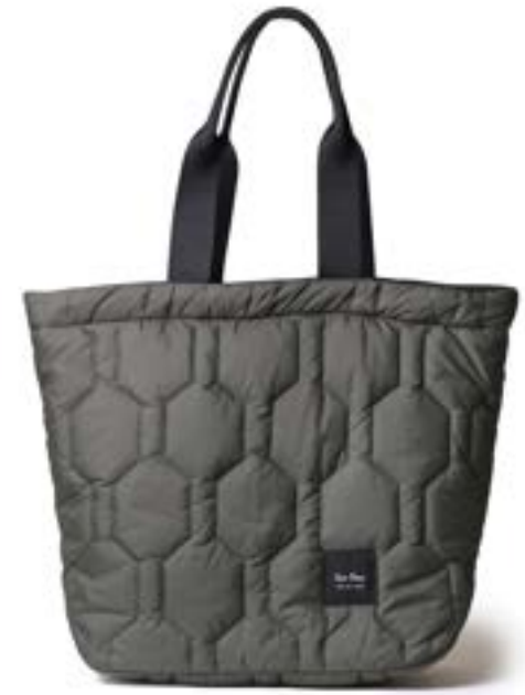
GEORGIA KHAKI $120