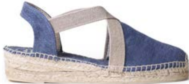
VERDI-V BLUE $120