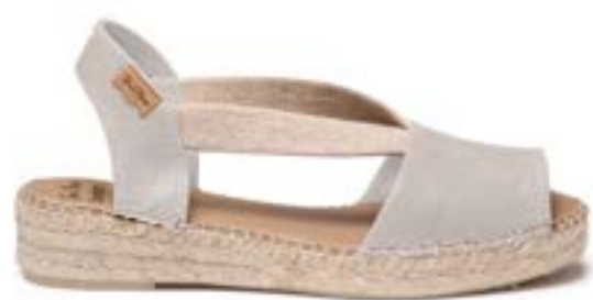
TALA ICE $152.9