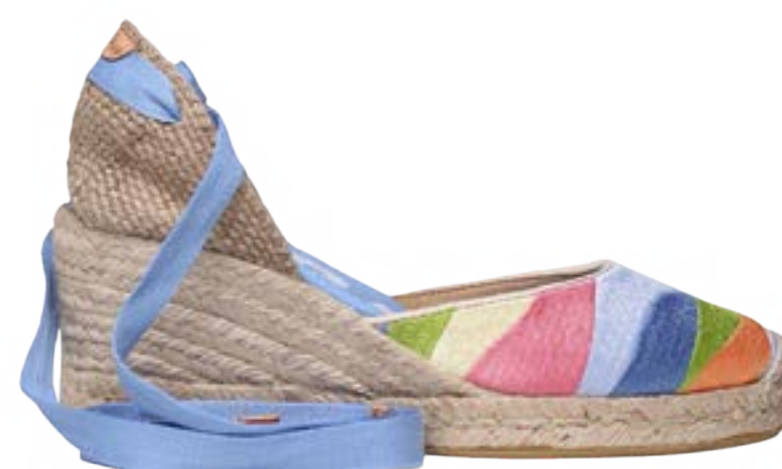
CASTELL WAVES $175