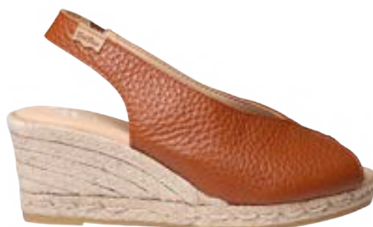
BOIRA TAN $175