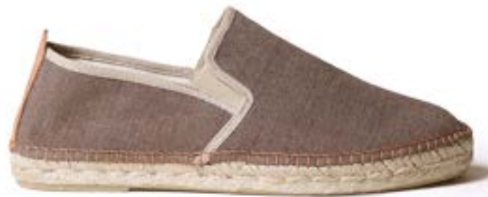
DALLAS BROWN $175