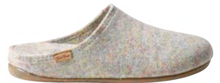
MONA-FR MULTI $77