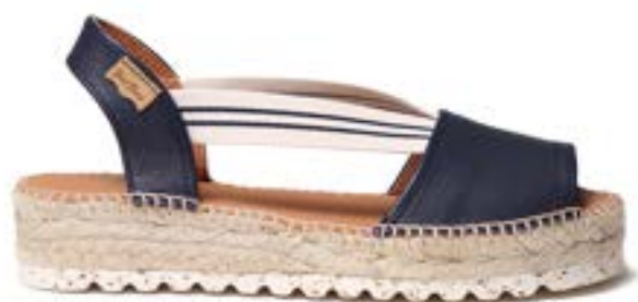
ESTEL-SW NAVY $160