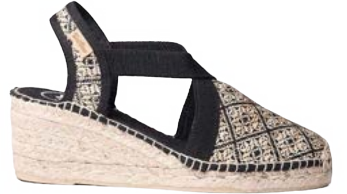
TERRA-GE BLACK $149