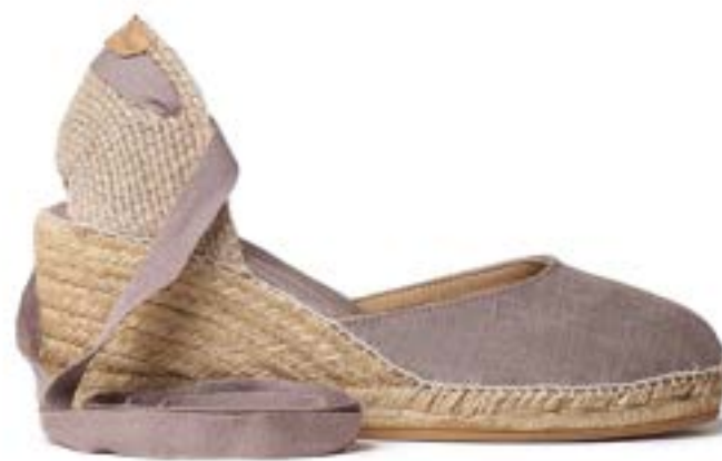
CALONGE TAUPE $142