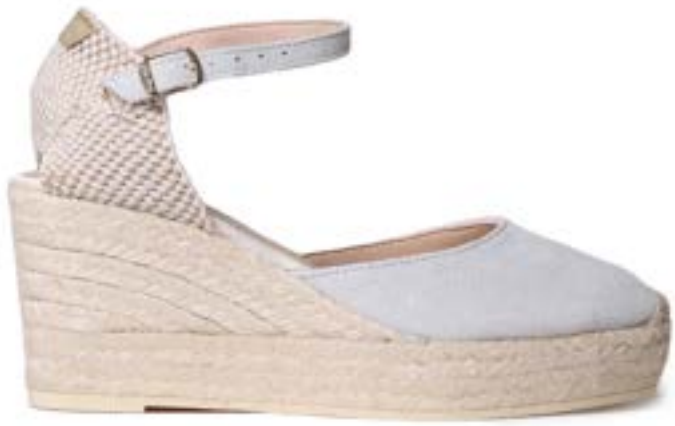
MATILDA SILVER $219