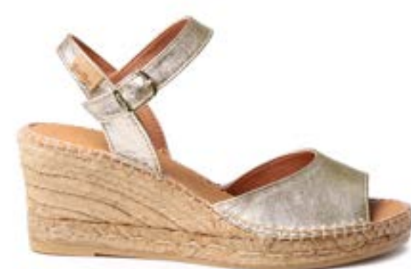
SIA-P PLATINUM $164