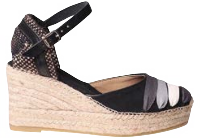
LOLA-NE BLACK $164