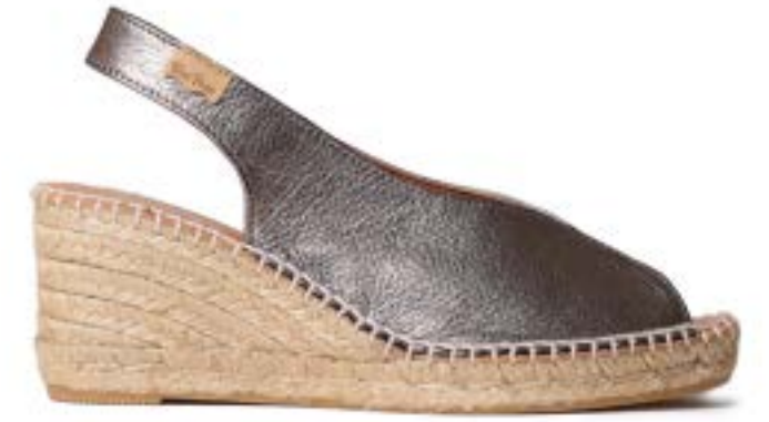
LAILA-P BRONZE $164