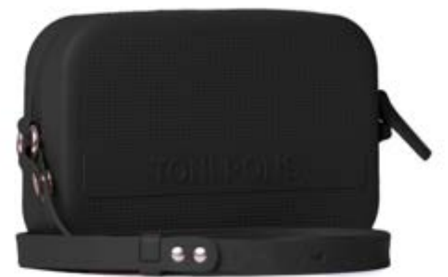
GINGER BLACK $98