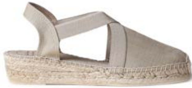
VERONA STONE $121