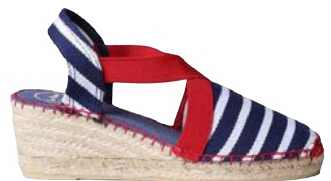
TARBES NAVYNER $127