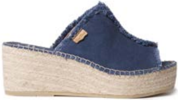
ITACA NAVY $160