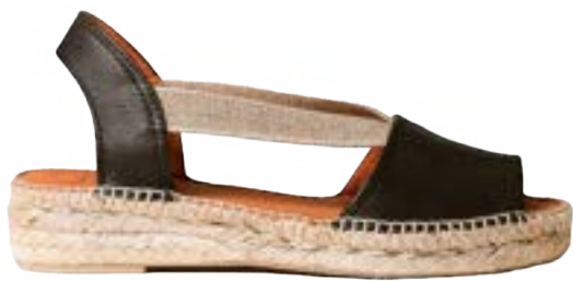
ETNA BLACK $138