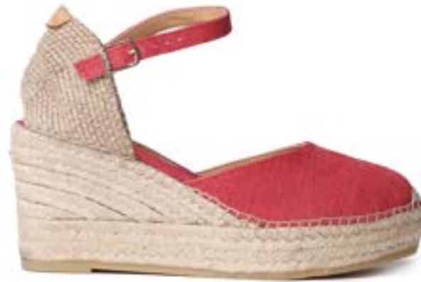
LAIA-NT RED $175