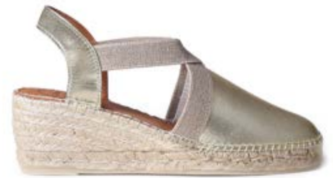
TOSSA PLATINUM $153