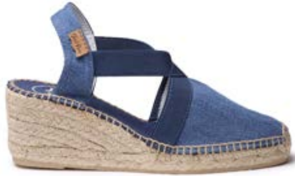
TER DENIM $121