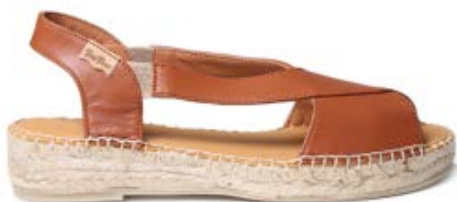
ELDA-P NOUGAT $160