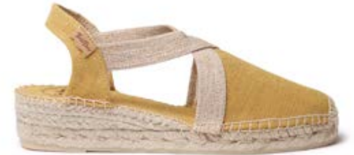
VERDI-V YELLOW $120