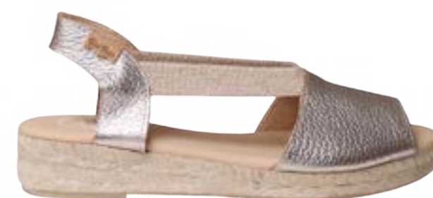
NUVOL PLATINUM $164