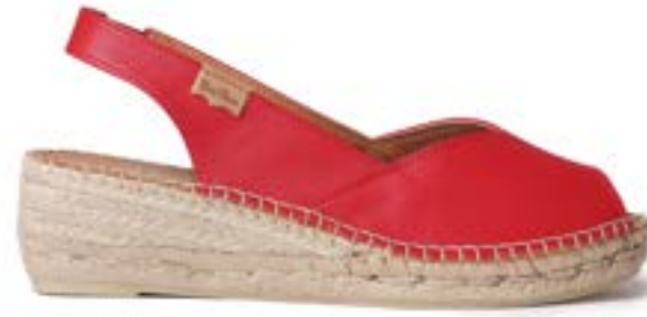
BERNIA-P ROIG $160