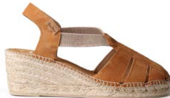
TRAPA TAN $153