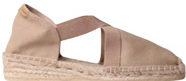
ELASTIC STONE $87