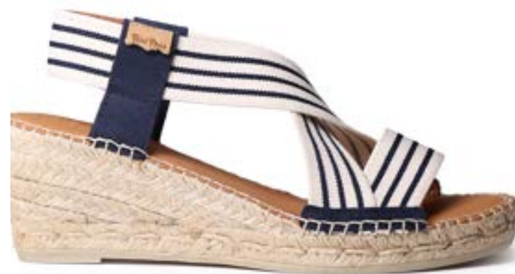
TINA ECRU-NAVY $149