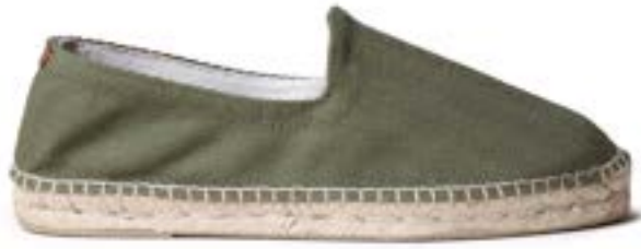
MONTGRI KHAKE $98