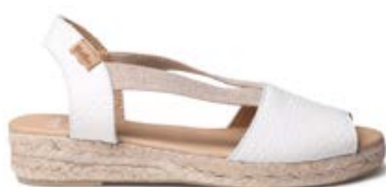
NUVOL WHITE $164