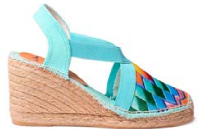
GARDENIA NAVY $153