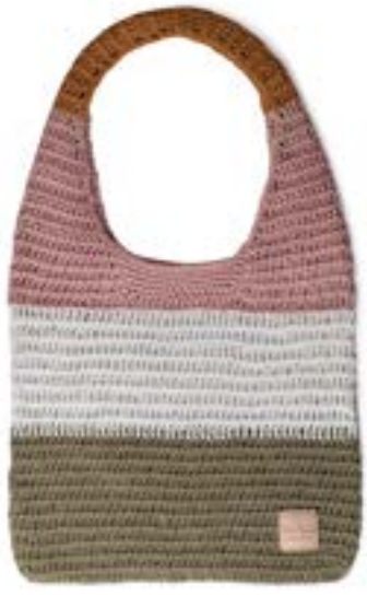
GABRIELA TROPIC $87