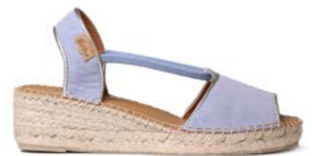
BILDA DENIM $175