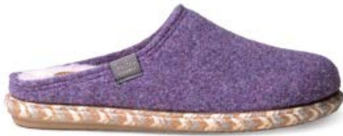
DELI-FP RASPBERRY $94