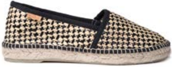
ALMA-ET BLACK $121