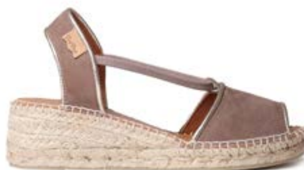
BILDA TAUPE $175