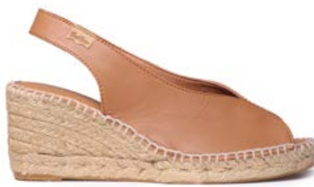
LAILA-P TAN $164