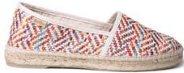
ALMA-MS MULTI $138