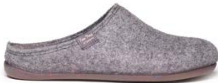
MONA-FR GRAY $77