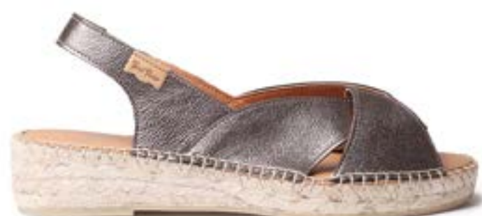
ENOLA-P BRONZE $160