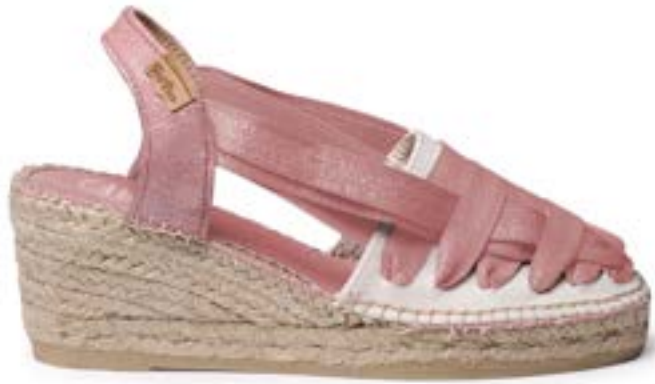
TRACY-CZ BLUSH $160