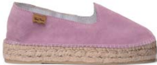
KEIRA LAVENDER $135