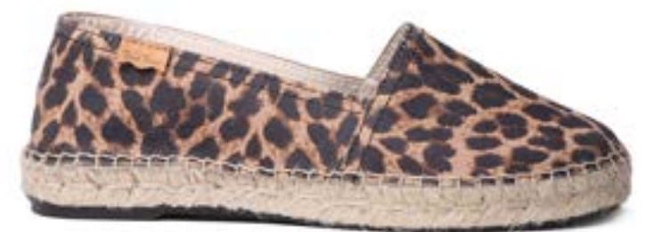
RUANDA LEO $153