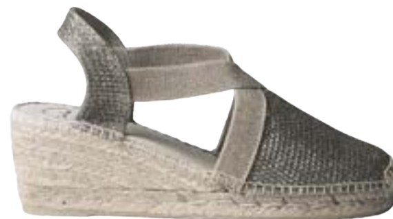
TRITON OLIVE $131