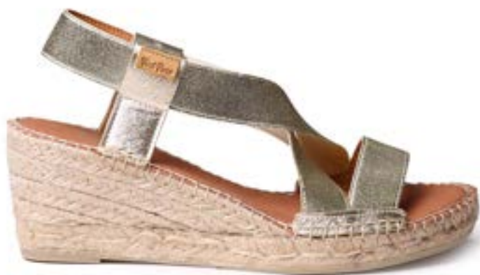
TURA-RC PLATINUM $149