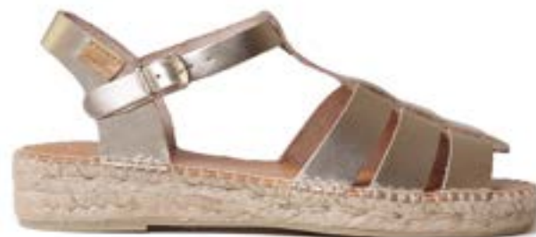
EMMA PLATINUM $149