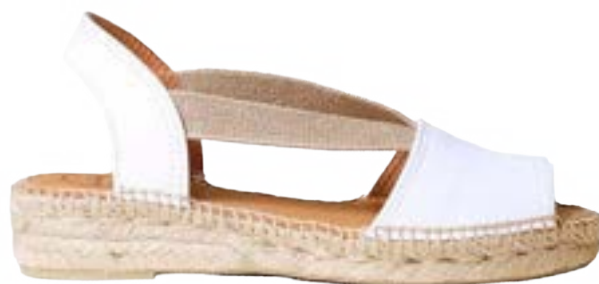
ETNA WHITE $138