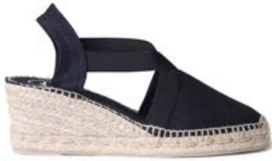
TER BLACK $121