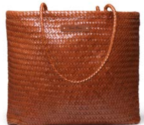
SIMONA TAN $241