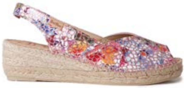
BERNIA-PM TAUPE $160