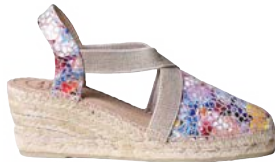
TELVA-PM TAUPE $149