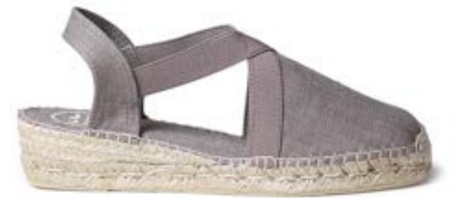
VERONA TAUPE $121