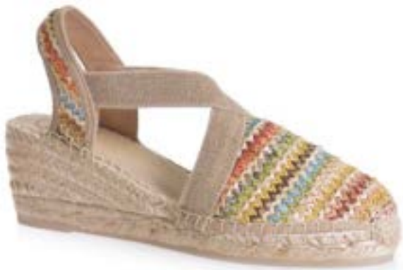
TERRA-MA MULTI $149