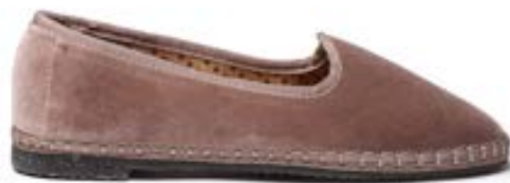
CINTIA TAUPE $160