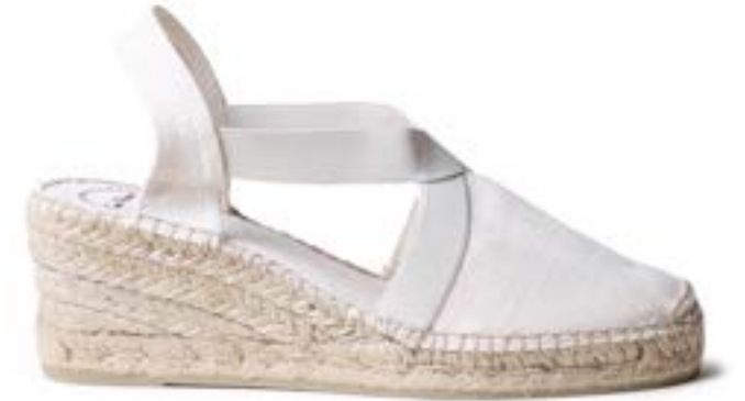
TER ECRU $121