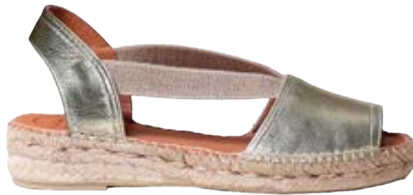
ETNA PLATINUM $138