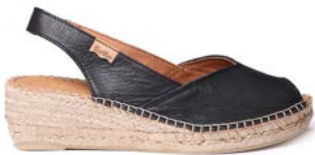
BERNIA-P BLACK $160