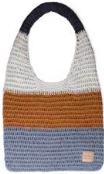
GABRIELA NICE $87