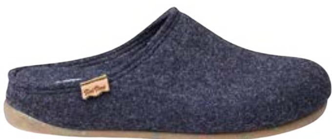
MONA-FR NAVY $77