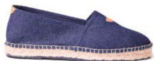
BLANES-GS NAVY $98