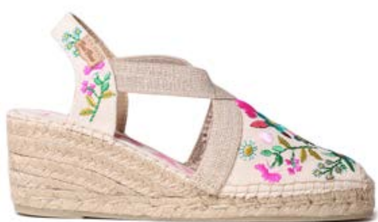
MONTJOI FLORAL $182