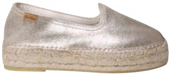
KEIRA CHAMPAGNE $135