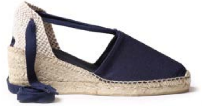
VALENCIA NAVY $127