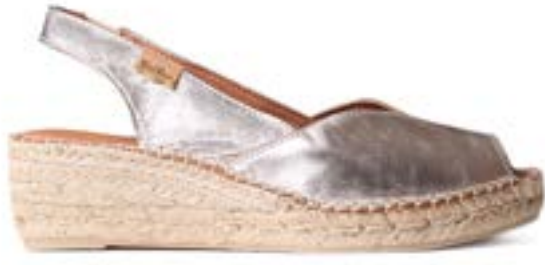
BERNIA-P PLATINUM $160