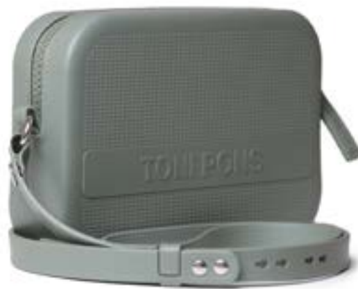
GINGER MINT $98