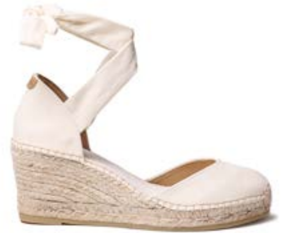
JULIA ECRU $153