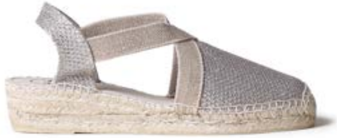
VELINO PLATINUM $131