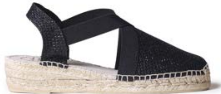
VELINO BLACK $131