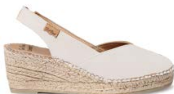
TERMAL ICE $171