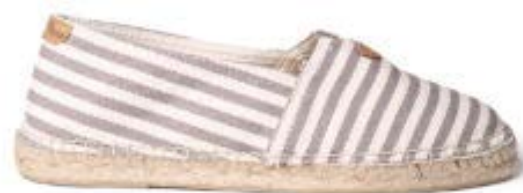
BLANES-DD TAUPE $98