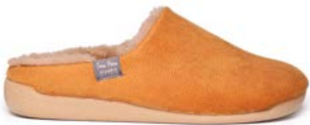
MOSUL-BD TAN $87